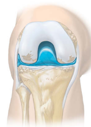
Osteoarthritic Knee with VISCO-3 Treatment