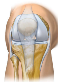
The Healthy Knee

Together, you and your doctor can determine the best treatment options for you. The good news is that osteoarthritis knee pain can be treated.